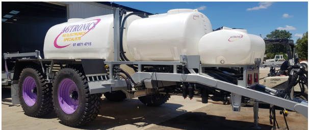
8000L CART WITH 2000L SPOT TANK & 600L FLUSH TANK